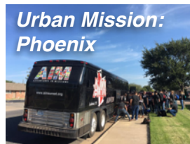
Urban Mission: Phoenix

The elders would like to invite our guests to join us next Sunday, Oct. 1 at 12 noon to discover all about the history and vision of Canyon Church. Members who have yet to attend Discover Canyon are also invited. This will be a relaxed time to share some information about who we are and where we're going, and get to know each other better. Lunch will be provided. If you are interested in attending, please respond by no later than this Wednesday, Sept. 27 by e-mail to staff@canyonchurch.org or phone (623-889-7146). Please mention the number attending and if childcare is needed. We look forward to seeing you there!